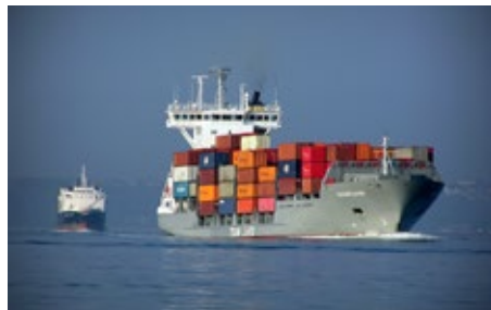
Experts for retrofit engineer individually tailored and cost-effective modernizations.