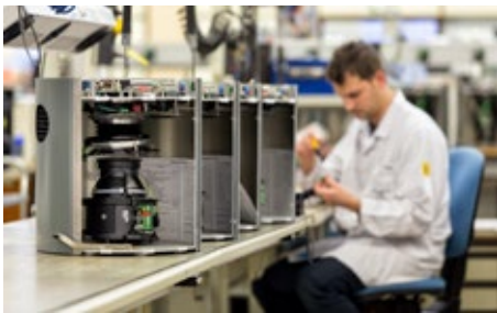
High-quality products are easy-to-use, functional, durable and support efficiency.

Leveraging our broad navigational and maritime expertise, we also participate in international maritime R&D projects, IMO working groups or industry panels such as CIRM. In our own innovation hub, the “RAN-Dock” we are working creatively on maritime innovations – internally and together with our customers and partners – while we are monitoring and exploring the most promising maritime trends.