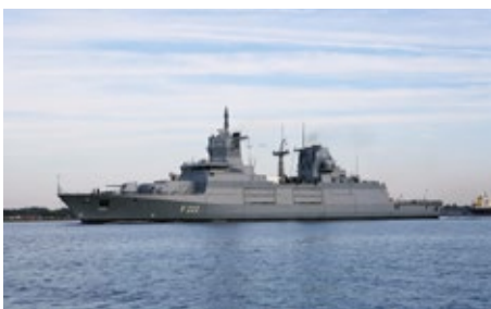
Bridge system integrator and service provider in large naval programs.