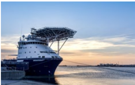
Delivering customized Integrated Bridge Systems for advanced commercial ships.