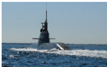
Highly specialized submarine systems for data management, navigation, steering.