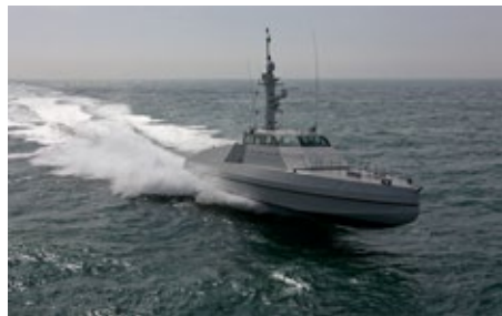
Single source for cost-effective integrated mission management solutions