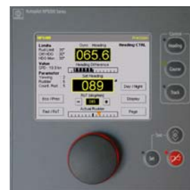
The new NautoPilot 5000 autopilot series features a large graphical display.

The new autopilot's most obvious feature certainly is its large graphical display which offers six different day and night modes within an intuitive to operate touch screen. The screen is designed in line with the colour palettes which are in use for the display systems of Radar, Chart-Radar and ECDIS. Clearly arranged functions are accessible via push buttons or the touch screen to ensure operation is kept as simple as possible.